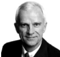
Helmut Panke, Ph.D., 64 Director since 2003