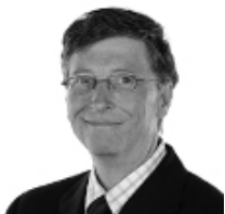
William H. Gates III, 54 Director since 1981

Mr. Gates, a cofounder of Microsoft, has served as Chairman since our incorporation in 1981. Mr. Gates retired as an employee effective July 1, 2008, but continues to serve as an advisor on key development projects. Mr. Gates served as Chief Software Architect from January 2000 until June 2006, when he announced his two-year plan for transition out of a day-to-day full-time employee role. Mr. Gates served as our Chief Executive Officer from 1981 until January 2000, when he resigned as Chief Executive Officer and assumed the position of Chief Software Architect.