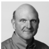
Steven A. Ballmer, 54 Director since 2000

Mr. Ballmer has headed several Microsoft divisions during the past 30 years, including operations, operating systems development, and sales and support. In July 1998, he was promoted to President, a role that gave him day-to-day responsibility for running Microsoft. He was named Microsoft's Chief Executive Officer in January 2000, assuming full management responsibility for the Company.